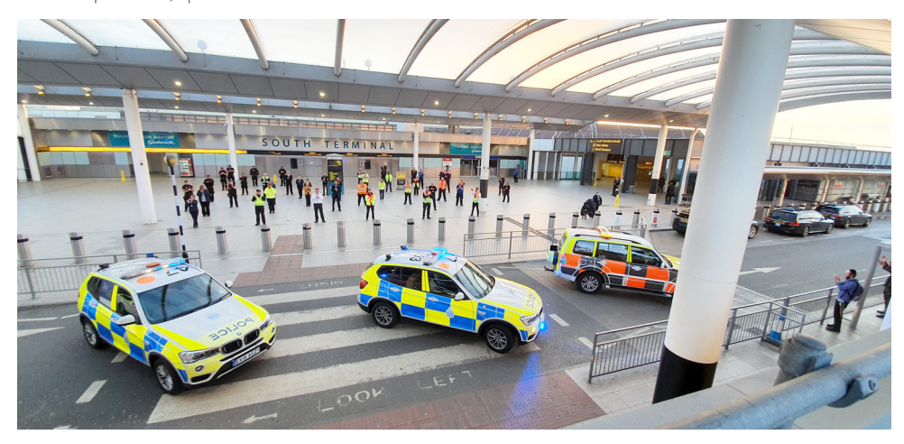
Gatwick Clap for Carers, April 2020