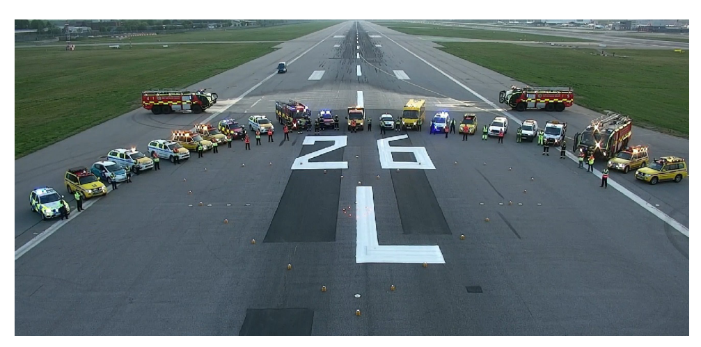
Gatwick Clap for Carers, April 2020

Our commitment to diversity, inclusion and development remains strong and we will be refreshing these programmes during 2021.